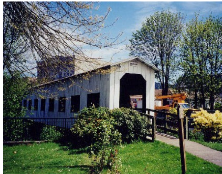
Centennial Footbridge, Downtown Cottage Grove

Additionally, the conference will host several nationally known speakers in the areas of gangs and high risk youth and mobilization of awareness and prevention programs for individuals, schools, agencies, and communities.